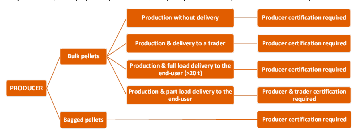
Figure 1: The certification required by Producers depending on different business activities

All processes, except pellet production, may be performed by an external service provider.